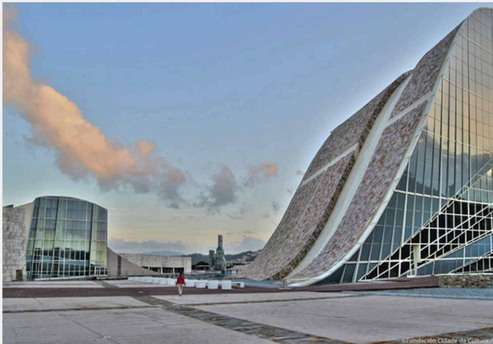
The Cidade da Cultura in Santiago de Compostela hosted the first two editions Connect FICTION.

The Dyou previous editions Connects Fiction were held in Santiago de Compostela, Galicia . The of 2018 It was attended by more than 530 professionals from more 20 countries Celebrating for three days over 2,400 meetings - 1,327 of which they were of online diary - and a potential business volume encryption several hundred million euros they have started to materialize with several television series in development and production today.