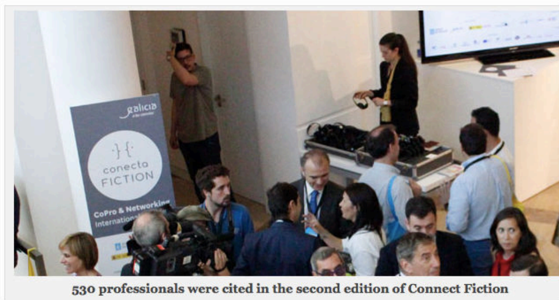
530 professionals were cited in the second edition of Connect Fiction

According to the Navarra Film Commission The Office of the Government of Navarre runnings integrated into the Public Company NICDO, he managed in 2018 a total 95 audiovisual projects , Two of which were series and eleven television programs.