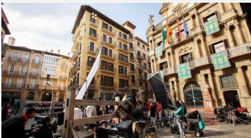
Filming in Pamplona

We were not mistaken as to the holding Connect Fiction 3 , But on the venue. Today, through a press release, we have known that this pioneer in promoting networking, co-production of fiction and exchange of talent between America and Europe, stage and event changes is transferred to Pamplona, Pamplona.